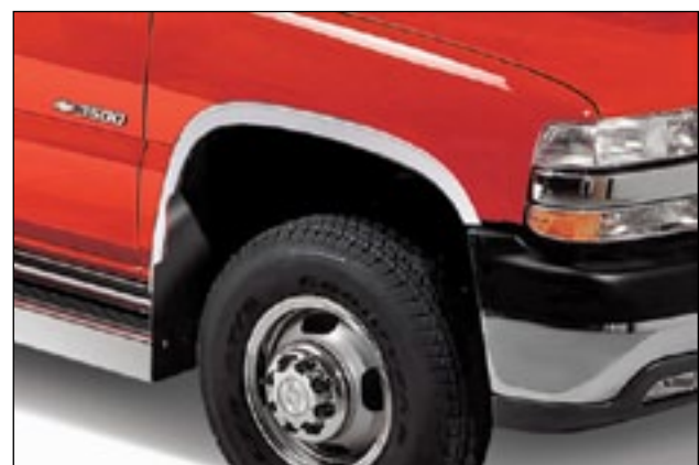
Stainless steel fender trim is a wise option to make your car or truck look great.

Chrome accessories that are custom designed typically take only minutes to install. They can be fitted on the most popular vehicles and perfectly match the OEM (original equipment manufactured) chrome. These chrome products do not require cutting and drilling, and you can simply "peel and stick" using the pre-applied tape that is designed particularly for automotive use. It can hold